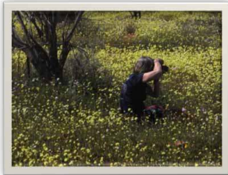
Sitting in the wild flowers Morawa