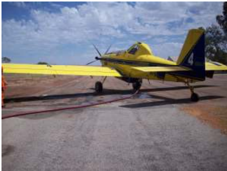
Water Bomber at the Northam Air Strip