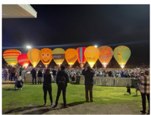
Balloon Glow at Elevate Festival Northam