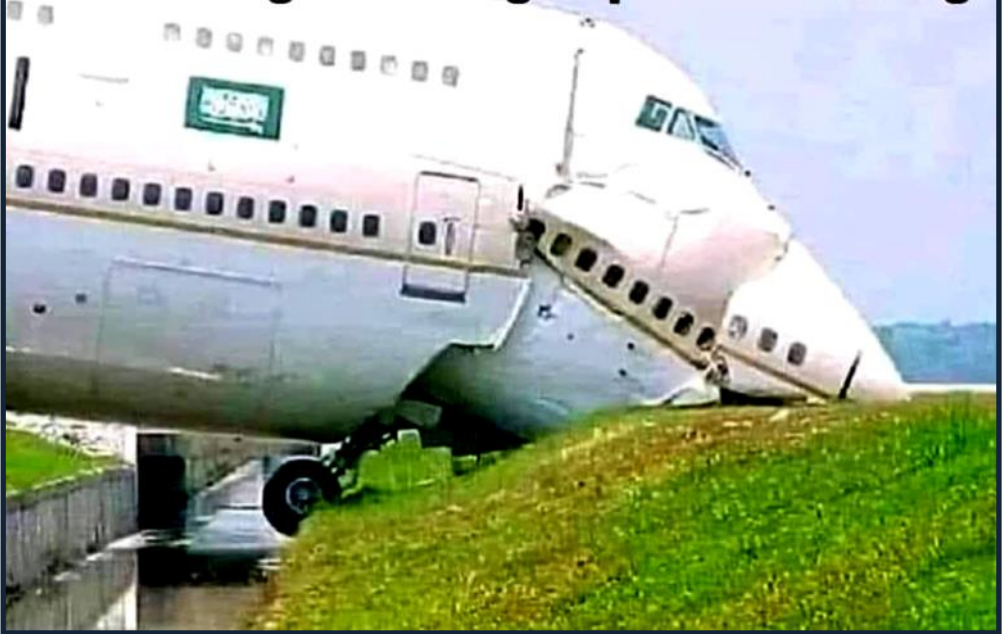
Rare footage of a vegan plane refueling